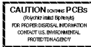
Figure 3. 1-in. x 2-in. PCB label.

If the standard PCB label is too large to fit on a piece of equipment, a 1-in. x 2-in. PCB label may be substituted, as shown in Figure 3 .