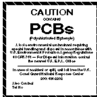
Figure 2. Standard PCB label.

As shown in Figure 2 , standard PCB labels are square and are available in 1-in. increments, from 2 in.x 2 in. to 6 in x 6 in.