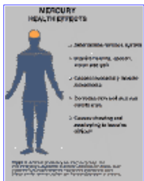
Figure 5. All forms of mercury are toxic to humans, but methylmercury is especially of concern because our bodies have a less well developed defense mechanism against this toxin. Effects on the nervous system are the most prevalent in humans.

Humans generally uptake mercury in two ways: (1) as methylmercury ( \text{CH}_3\text{Hg}^+ ) from fish consumption, or (2) by breathing vaporous mercury ( \text{Hg}_0 ) emitted from various sources such as metallic mercury, dental amalgams, and ambient air. Our bodies are much more adapted for reducing the potential toxicity effects from vaporous mercury, so health effects from this source are relatively rare. Methylmercury, on the other hand, affects the central nervous system, and in severe cases irreversibly damages areas of the brain