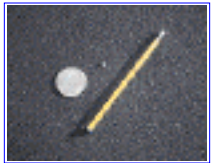
Figure 2. The droplet of mercury shown in this slide is about 1 gram; the same amount that is in a standard mercury thermometer and the total amount that is deposited annually on a lake in northern Wisconsin with a surface area of 27 acres.

This is a difficult question to answer, in part because of a lack of adequately preserved fish specimens of preindustrial age to compare against contemporary samples. However, several lines of evidence from recent studies on Wisconsin lakes suggest that increase emissions to the atmosphere, and subsequent higher deposition rates to lakes, likely translate into higher mercury levels in fish. Although the total amount of mercury delivered to one of these lakes annually is very small