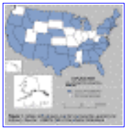
Figure 1. States with at least one fish consumption advisory for mercury.

During the past decade, a new trend has emerged with regard to mercury pollution. Investigations initiated in the late 1980's in the northern-tier states of the U.S., Canada, and Nordic countries found that fish, mainly from nutrient-poor lakes and often in very remote areas, commonly have high levels of mercury. More recent fish sampling surveys in other regions of the U.S. have shown widespread mercury contamination in streams, wet-lands, reservoirs, and lakes. To date, 33 states have issued fish consumption advisories because of mercury contamination