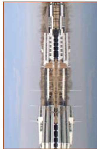
Meadowlands Environment Center

PRSR-STD U.S. POSTAGE PAID Rutherford, NJ 07070 PERMIT NO. 41